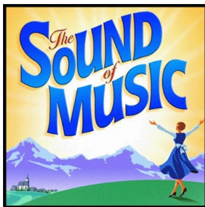
Performances January 27 and 28