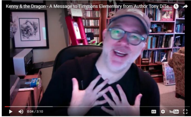
Author Tony DiTerlizzi

read his book Kenny & the Dragon during One School, One Book . He shared with them information on his writing process and life as an author.